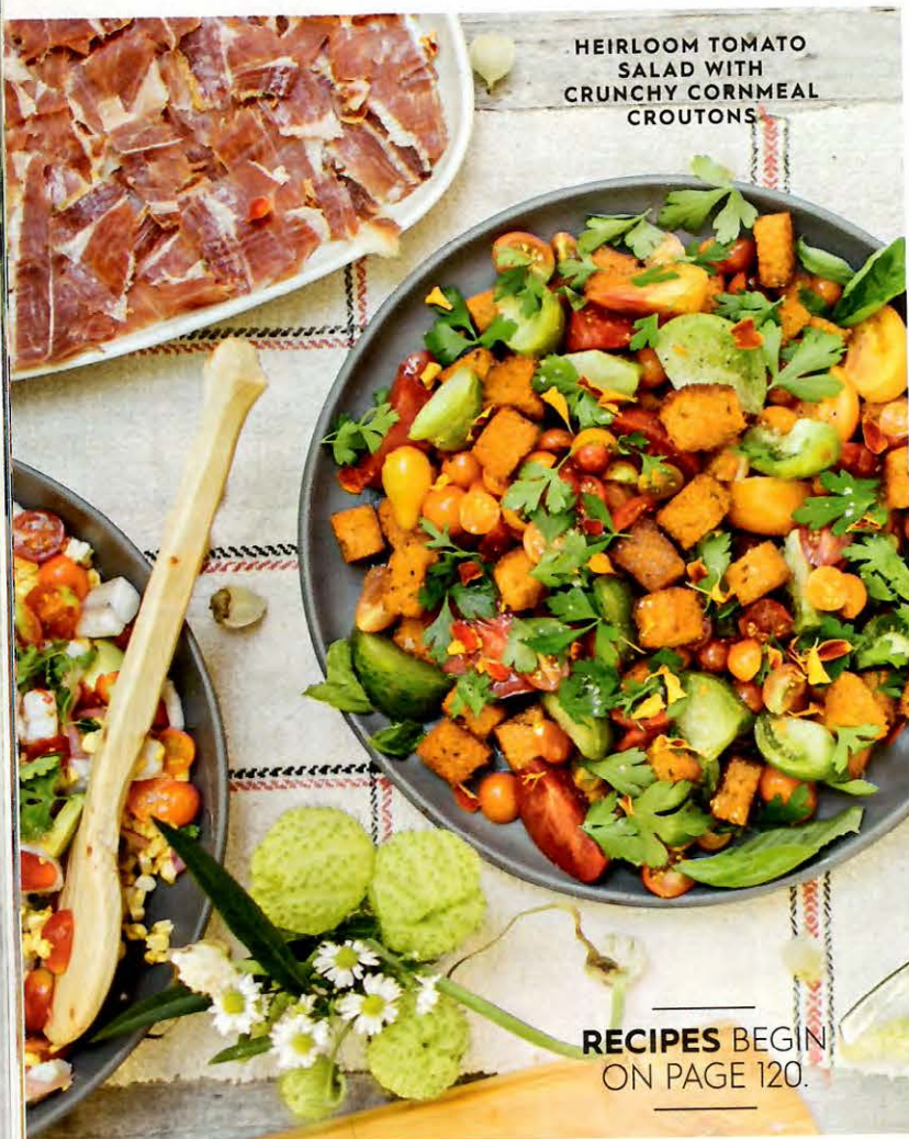
HEIRLOOM TOMATO SALAD WITH CRUNCHY CORNMEAL CROUTONS