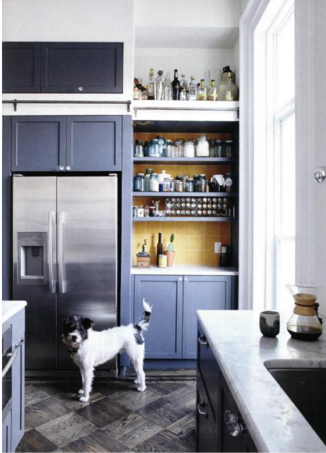
LEFT: Yellow concrete tiles add a juicy hit of colour to the open pantry. Appliances, hardware, doors, Big Reuse. TOP RIGHT: A library ladder helps Julia access the upper cabinets, which are inset into the wall. Barstools, Horne. BOTTOM RIGHT: The arched backsplash behind the sink, clad in custom cement tiles, is a graphic focal point in the space. Pendants, Rejuvenation.